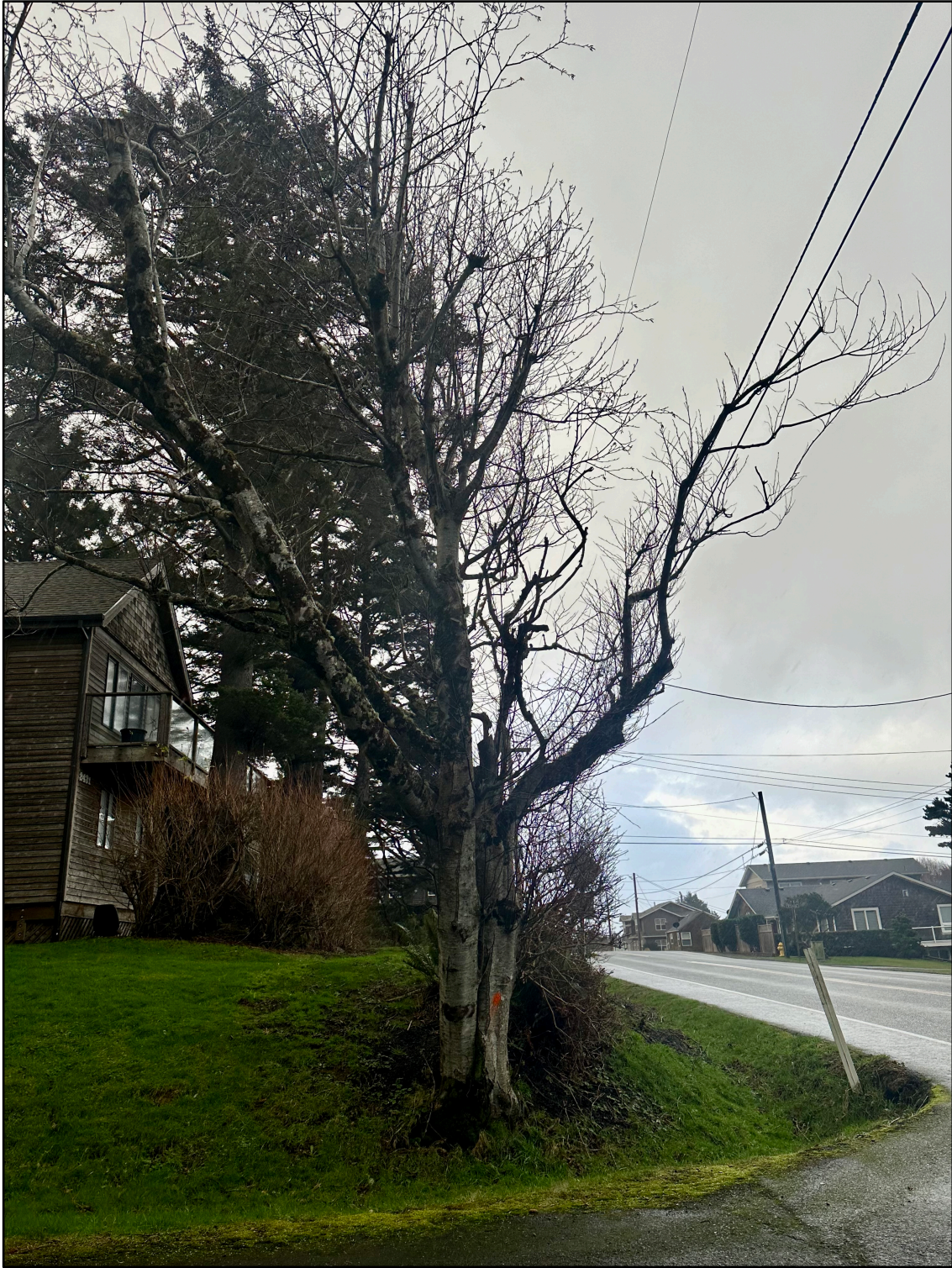
Alder tree located south of Amber lane

Treescapers Northwest P.O. Box 52 Manzanita, OR 97130